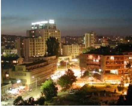
Prishtina by Night